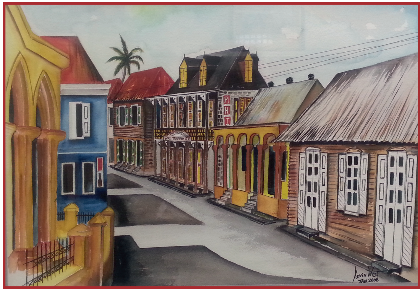
Parliament Street in Plymouth