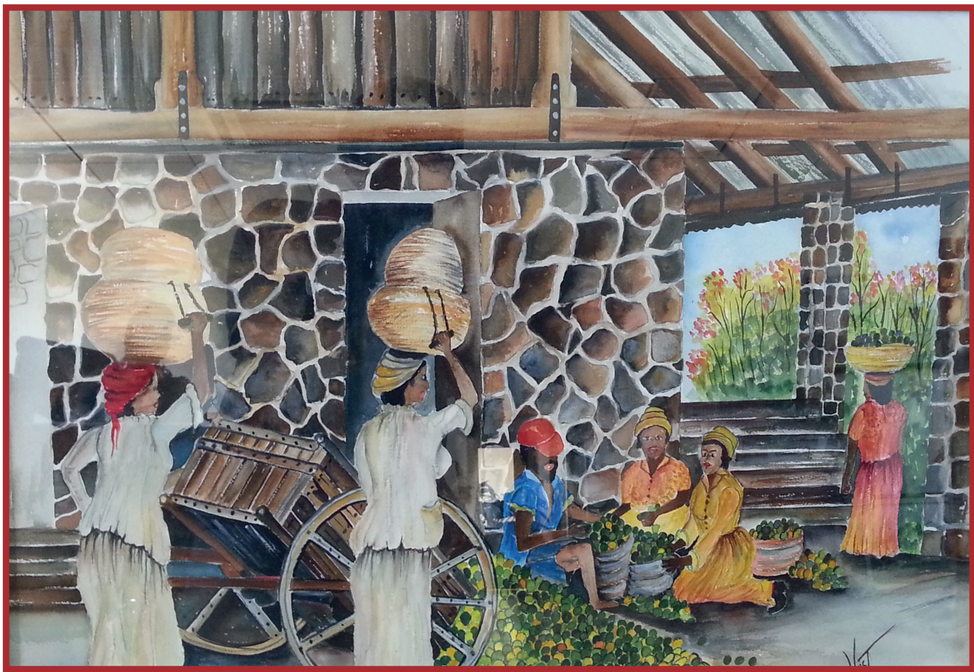
Women Sorting Limes at Elberton Estate